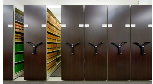
Example high density shelving

*Refurbish the old library space, including: removing the old carpet, refinishing the hardwood floors, putting gas inserts into the fireplaces, purchasing winged back chairs & end tables to face the fireplaces, purchasing waist-high book shelving units, updating the electrical system, & repainting the walls and ceiling.