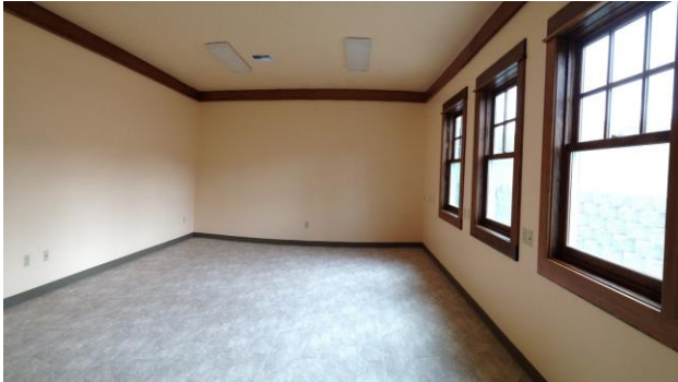
Dick Pace Archives Room

*Purchase high density archival shelving for the new climate-controlled Dick Pace Archives Room